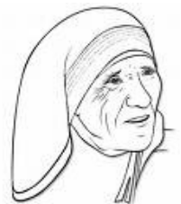
Blessed Mother Teresa of Calcutta