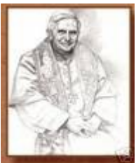
Pope Benedict XVI